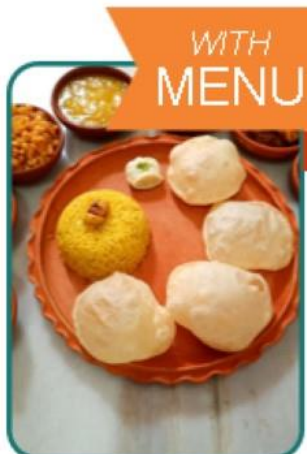
LAUNCH FACILITY ( HEALTHY AND NUTRITIOUS ) WITH MENU