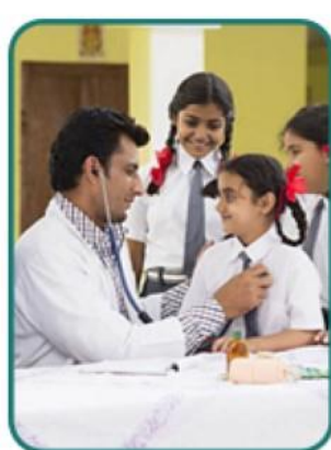
EVERY MONTH HEALTH CHECKUP WITH BEST DOCTORS AND FREE MEDICATIONS