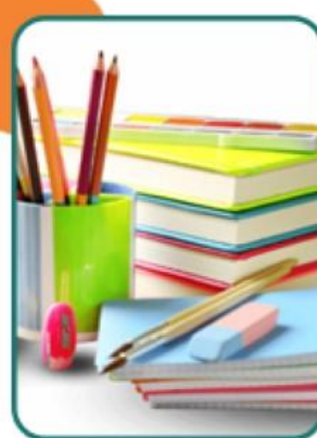
NOTE BOOKS AND STATIONARIES