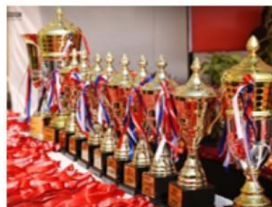
PRIZES DISTRIBUTION FOR TALENTED STUDENTS