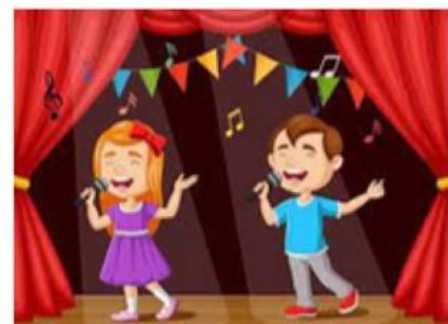
SPORTS AND INTERSCHOOL COMPETITIONS