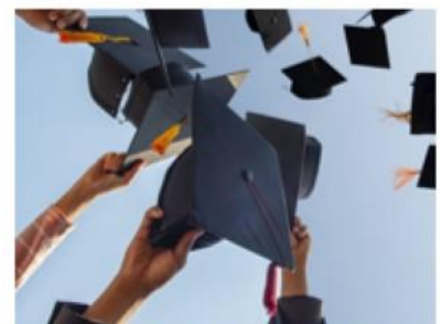
GRAND CELEBRATION OF GRADUATION DAY