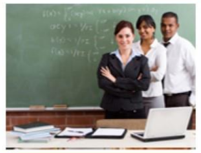
MORE THEN THREE TEACHERS FOR EACH SUBJECT