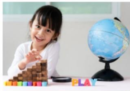
ENHANCED KIDS POTENTIAL