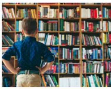
LIBRARY AND LABORATORIC FACILITY