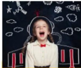
EDUCATIONAL & FUN TIPS