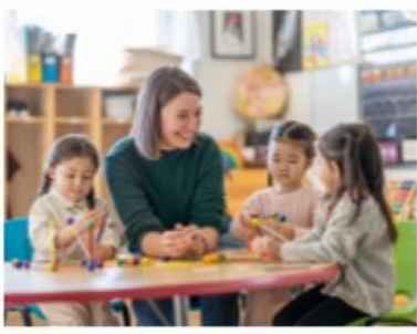
PROFESSIONAL TRAINED TEACHERS