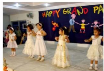
GRAND ANNUAL DAY PROGRAM