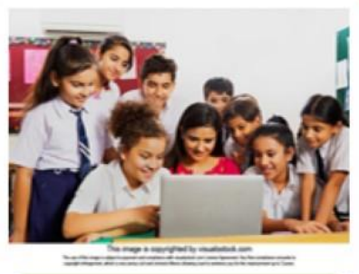
SUBJECT EXPERTISE TEACHERS